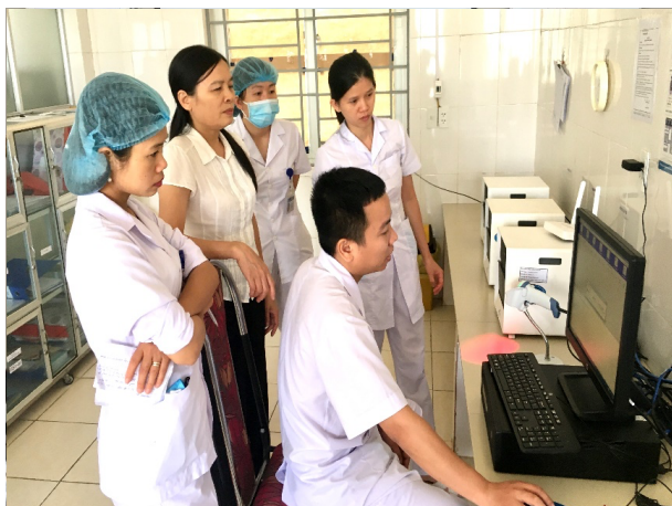
IDDS training session in Vietnam.

IDDS helps targeted countries avert the spread of these diseases, prevent and mitigate outbreaks, and inform interventions to reduce associated mortality and morbidity. IDDS aims to improve access to accurate, timely, safe, reliable, and integrated TB diagnostic tests for all presumptive TB cases. USAID and IDDS work with countries' TB programs to develop and implement comprehensive national TB/MDR-TB laboratory strategic plans to improve diagnostic networks.